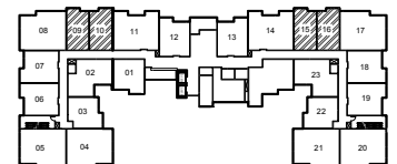
MAIN FLOOR KEY PLAN