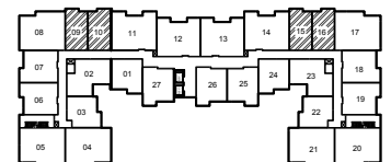
TYPICAL 2nd - 6th FLOORS KEY PLAN